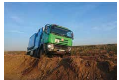
TATRA terrain chassis