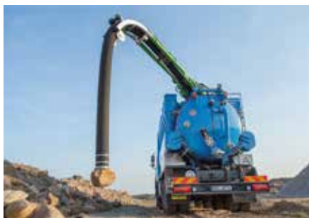
High suction output

Suitable for daily cleaning in heavy industry where the electrical drive saves money and environment. Diesel drive and high suction power is also available to be used in emergency or during downtime maintenance.