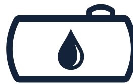
TANK CAPACITY up 12 m 3