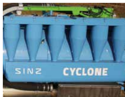
Original cyclone air filtration