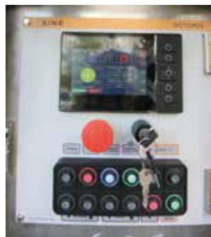
Intuitive SINZ Control panel.