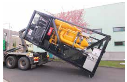
ABROL container option.