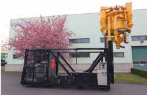
Large tank stroke, drain valve at a height of 3 m.