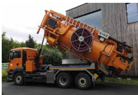
High tank capacity