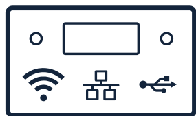
CONTROL PANEL with telematic

Proven technology for waste transport solutions and cleaning of hard-to-reach areas.