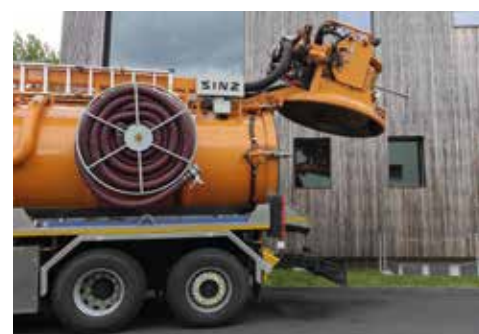
Suction hose winch for up to 25 m of DN 100 hose