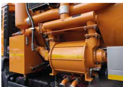
Vacuum pump SINZ 4200 m 3 / h